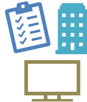
Community Capacity Building Funding (CCBF)